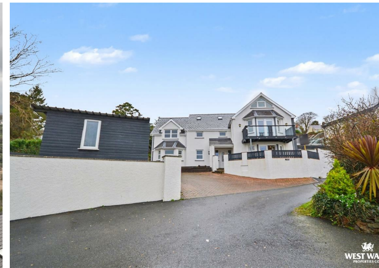
View from property

A well-presented property offering generous and versatile accommodation, enjoying far-reaching rural and sea views across Fishguard Bay. Conveniently positioned within easy reach of the shops, schools, and amenities of Goodwick, the property boasts four double bedrooms together with a separate one-bedroom annexe, making it ideally suited to a family or multi-generational living.